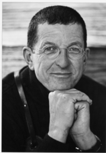
Antony Gormley

Antony Gormley (born 1950) is known worldwide for his sculptures, installations and works in public spaces. In all the works, the theme is the relationship of the human body to space. Gormley dedicates his work to the further development of the potential of sculpture, as has been evident since the 1970s, integrating his own body and the bodies of others into his work. In this way he poses fundamental questions about the relationship between the human being, nature and the cosmos. Gormley constantly attempts to understand the space of a work of art as a place in which new behaviours, thoughts and feelings are able to come into existence.