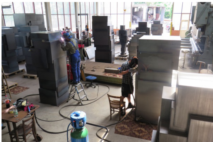
Production Expansion Field

Supported by Die Mobiliar, JTI, Stanley Thomas Johnson Foundation.