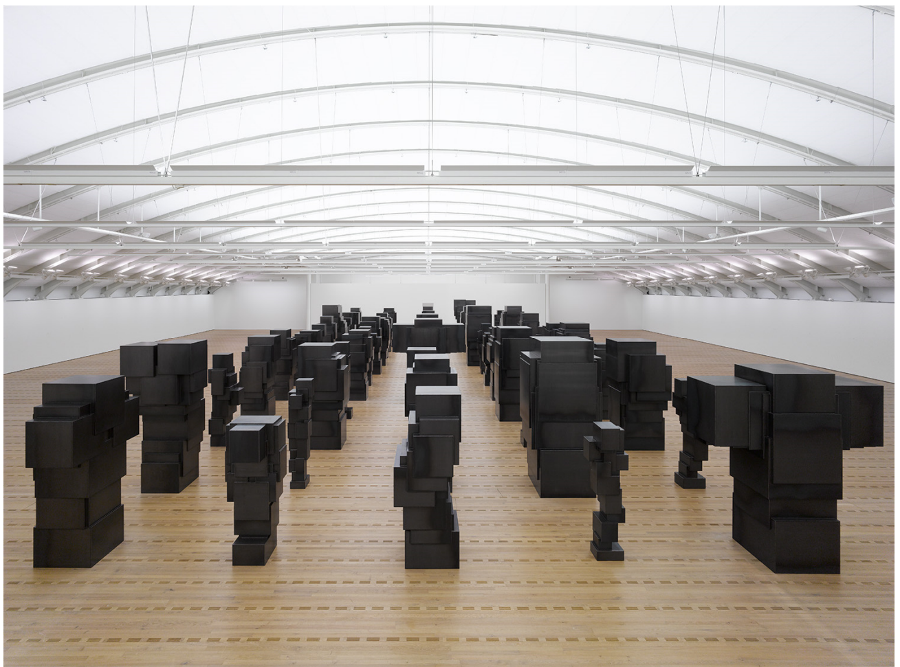
Antony Gormley EXPANSION FIELD, 2014 – Installation, Zentrum Paul Klee