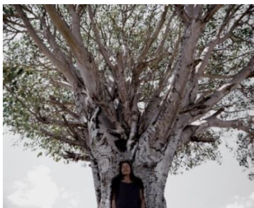
Shirin Neshat, Tooba, 2002.