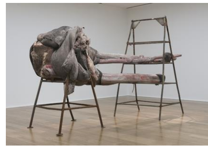
Berlinde De Bruyckere, After Cripplewood IV, 2014.