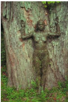
Ana Mendieta, Tree of Life, 1976, Courtesy The Estate of Ana Mendieta Collection and Galerie Lelong © The Estate of Ana Mendieta Collection, LLC

My art is grounded on the belief in one universal energy which runs through everything: from insect to man, from man to spectre, from spectre to plant, from plant to galaxy.